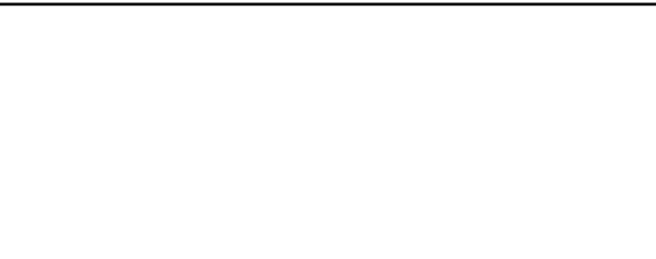
The photographs in this brochure are for promotional purposes only.