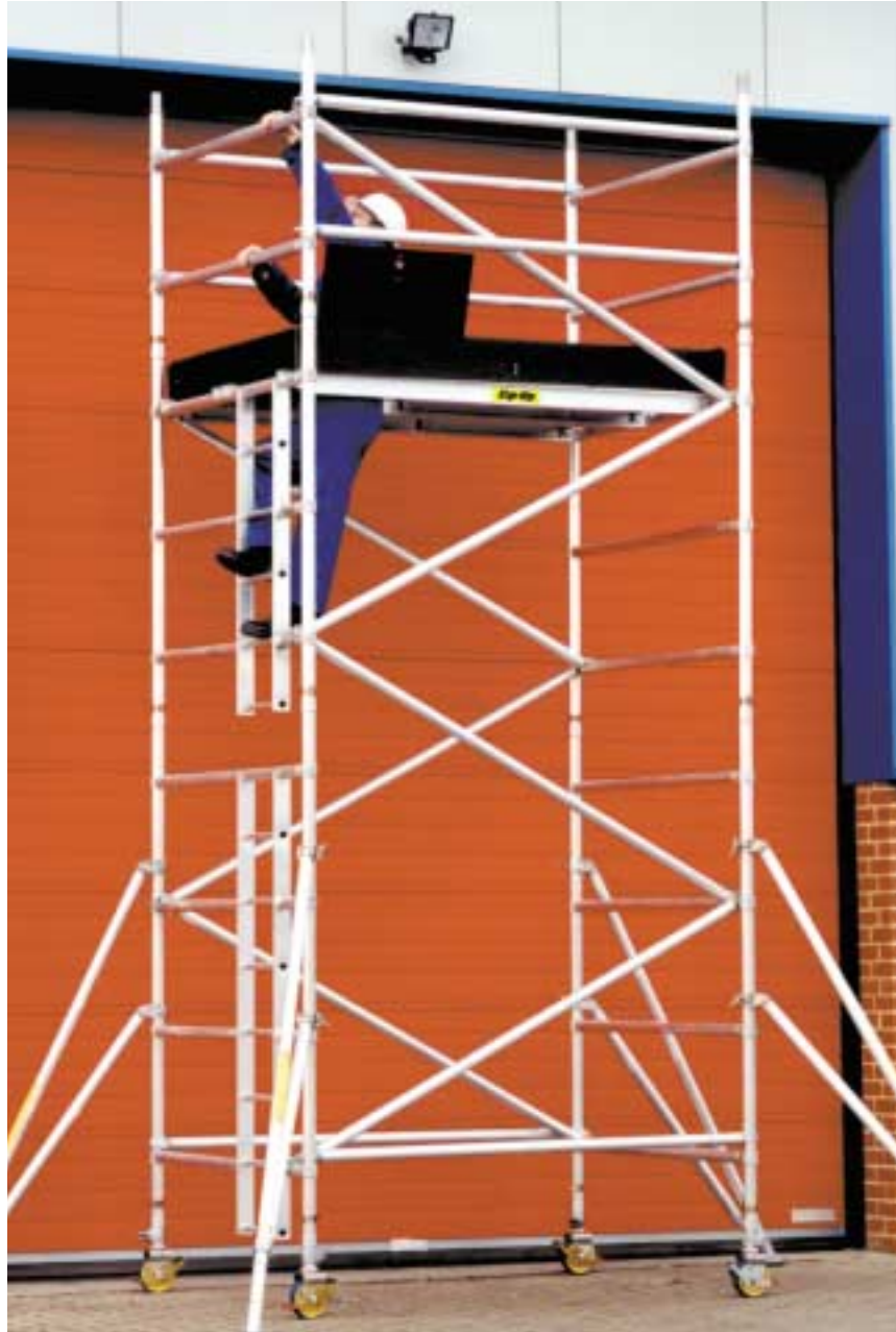
Span 500 ladderframe towers can be set up in minutes.

Zip-Up Span 500 ladderframe is fully compatible with other Span towers, walkways and accessories to ensure maximum functionality for each location.