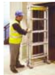
Easy access through standard doorways and elevators.

VX base sections fold into place in seconds providing a quick sound base for easy tower erection. Available in Single or Double widths.