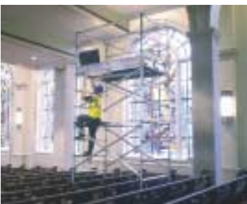
Easy access over pews and auditorium seating.