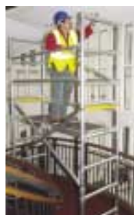
VX base on difficult access circular stairway.