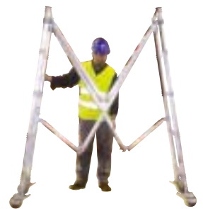
VX Base folds out in seconds.