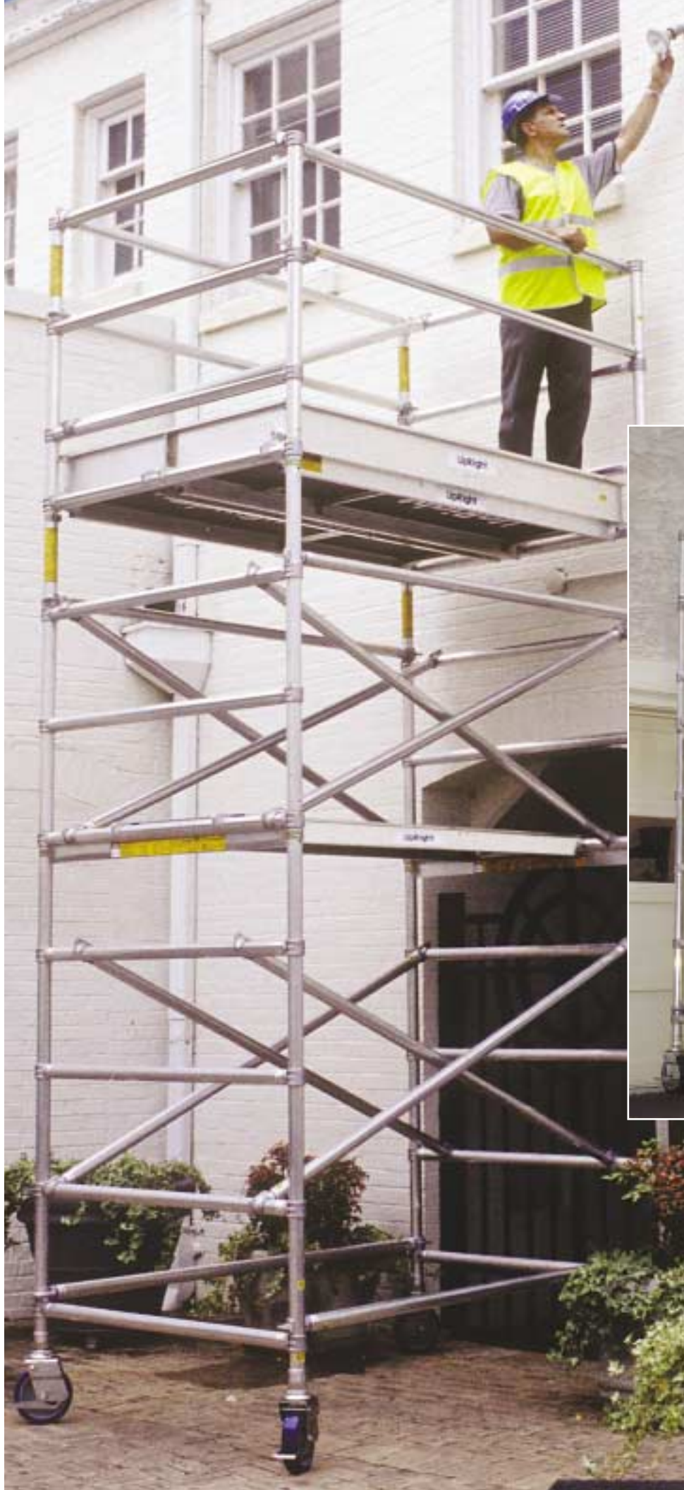
Double width Span tower.