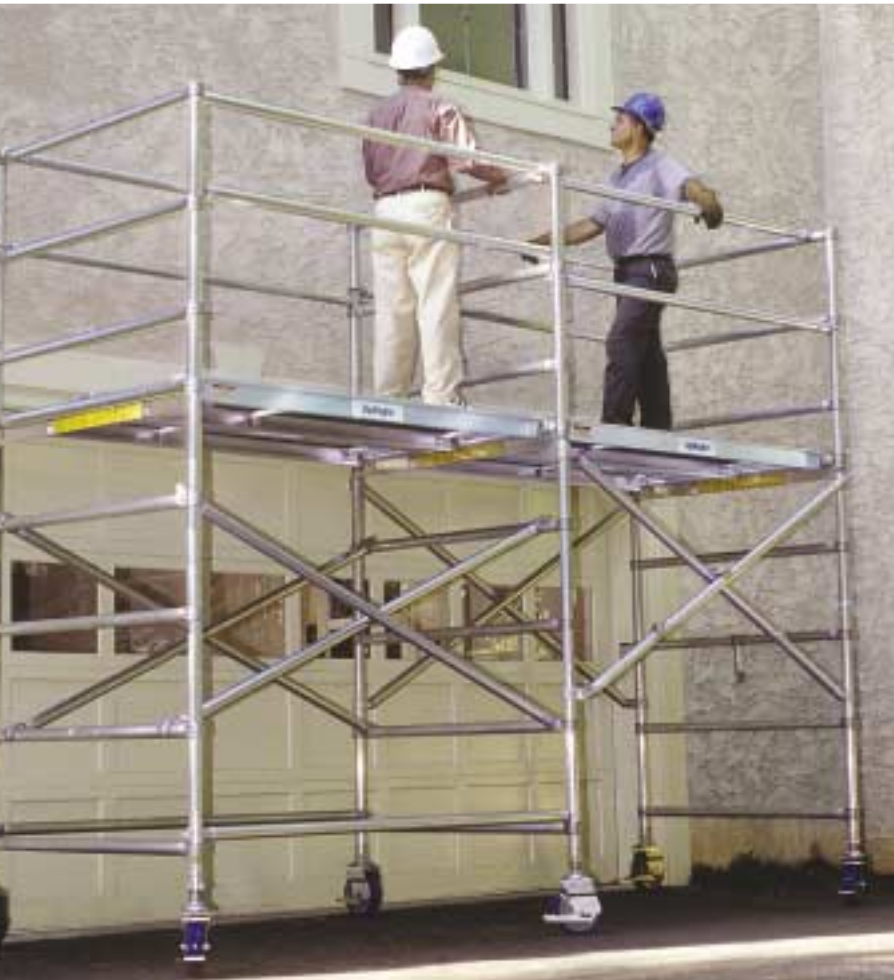
Components are inter-changeable and work together to create multiple configurations to custom heights, lengths and widths.