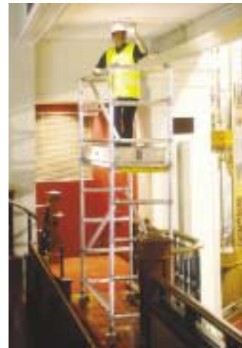
UpRight VX and Span Systems work in areas with difficult, limited access and where load weight is a concern.

Zippy is a low cost, versatile workstand for a variety of applications. Zippy can be easily transported in a small pick-up truck, and ready for use in seconds. If more height is required Zippy 20 is available with a 20ft. working height.