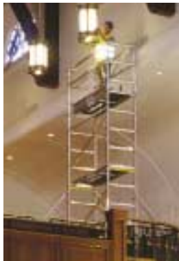
Single width Span tower ideal for restricted areas.